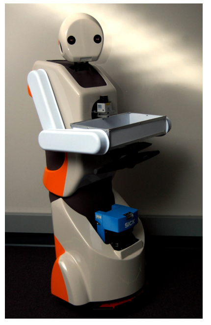
Figure 1. The Snackbot robot.

Copyright 2009 ACM 978-1-60558-404-1/09/03...$5.00.