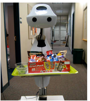
Figure 4. Prototype used for early technology feasibility study.

This early trial helped us learn about many tradeoffs we would face in the future design of the hardware, software, and interaction design of the robot. We subsequently decided to use a commercially available base for the Snackbot. A Pioneer base would be more reliable than a home-built base, and would provide mobile functions that would be easily replicable. It would also be quieter and less distracting to office residents. One drawback of using this kind of base is that it would create a set of constraints for the final industrial design of the robot housing. Such constraints included the dimensions of the robot, the availability (or lack thereof) of mounting points for the torso, and maximum load that could be carried. Our plans for the torso and other electronics exceeded the recommended weight limit of the Pioneer, and so later experiments were performed to learn the maximum reasonable weight the robot could carry while still having reasonable, operational battery life.